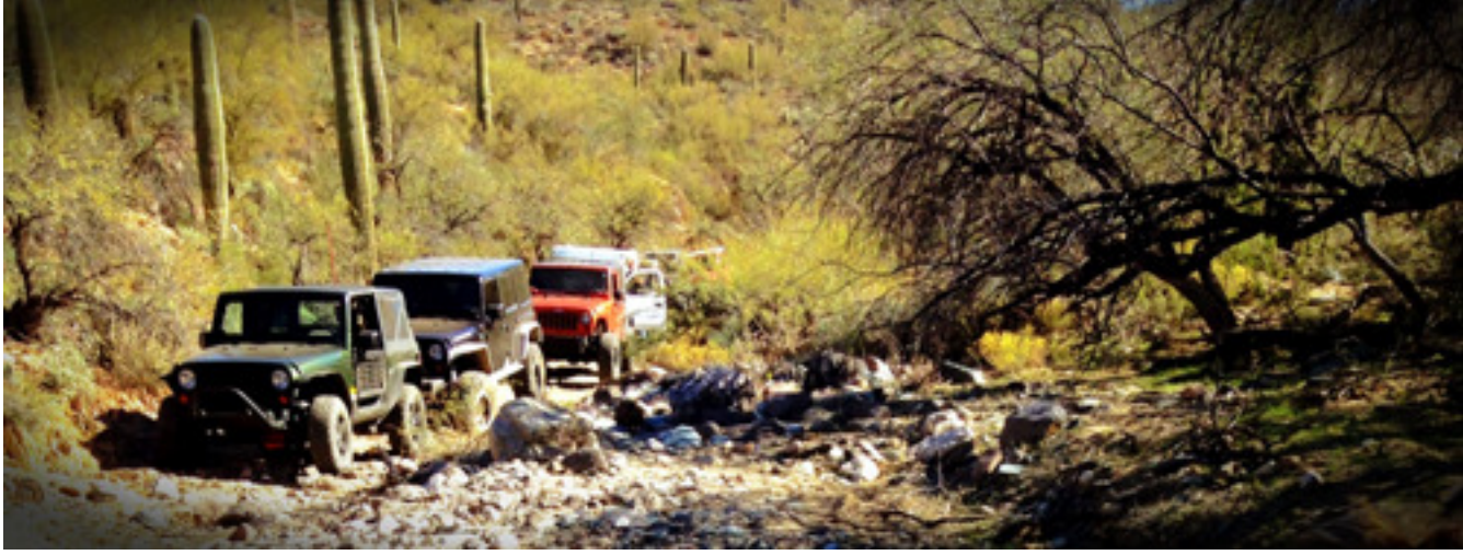
Upper Terminator technical vehicle trail at Table Mesa

It has been a busy month, but I did find time to get out on the trail with some new friends during my personal time. Many thanks to the Virtual Jeep Club for letting my wife and me tag along on two of their trips. They spotted us through some technical trails and shared their passion for rock crawling, even though we were driving a Tacoma :)