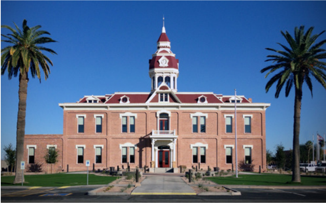
Historic Pinal County Courthouse in Florence, Arizona

Additionally, Florence has a fine collection of territorial architecture and some great Mexican food if you are hungry. Consider taking part in the 28th annual Tour of Historic Florence this weekend to see what I mean.