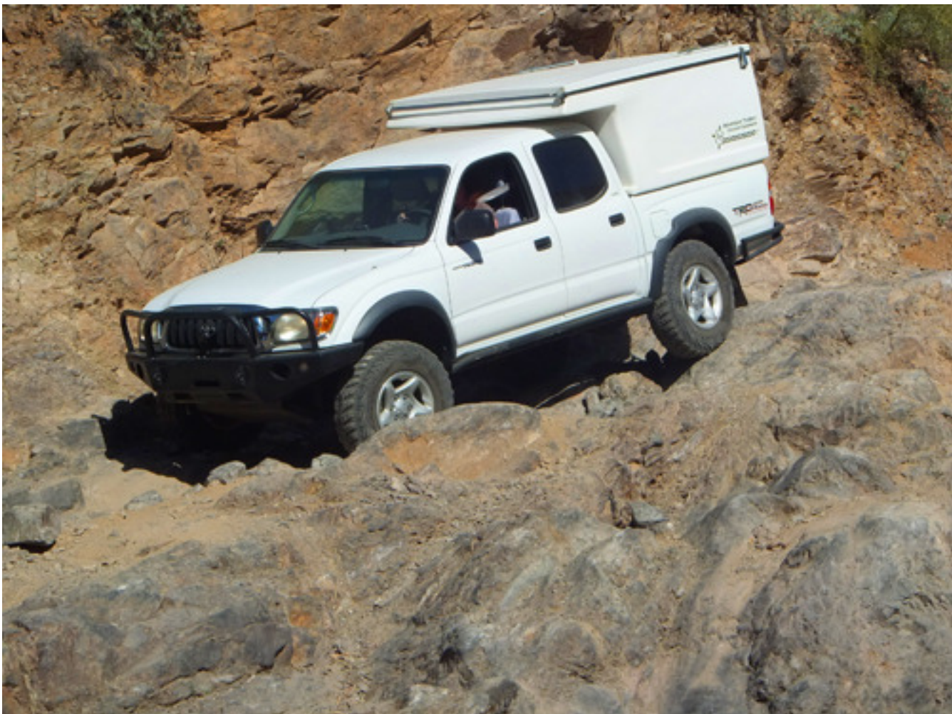
My wife enjoying one of the obstacles in Box Canyon

It has been a busy month, but I did find time to get out on the trail with some new friends during my personal time. Many thanks to the Virtual Jeep Club for letting my wife and me tag along on two of their trips. They spotted us through some technical trails and shared their passion for rock crawling, even though we were driving a Tacoma :)